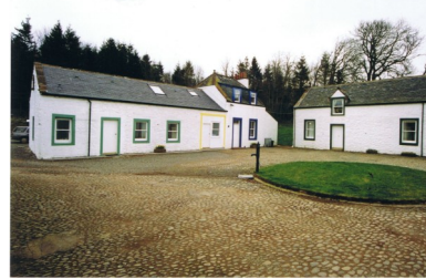
Our Holiday Cottages

Accommodation, meals & lots of activities learning about shepherding