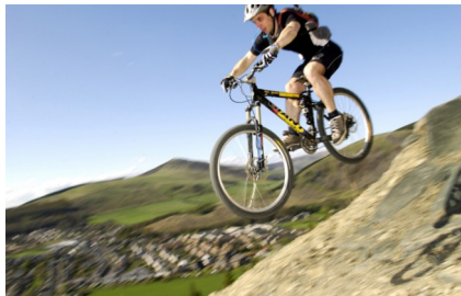
Heading Downhill Innerleithen