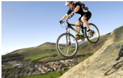
Heading Downhill Innerleithen