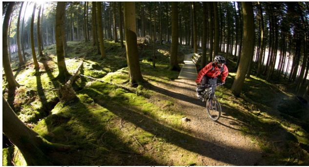
Newcastleton - woodland trail