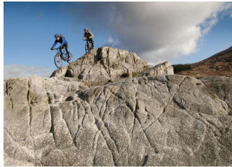
Challenging heights at Kirroughtree