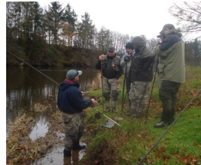
Learning to Wallis cast