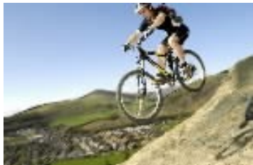
Heading Downhill Innerleithen