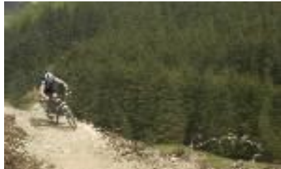
Close to the edge at Ae

Accommodation, meals & transport to & from each stane