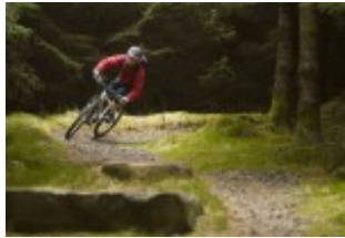
Newcastleton - woodland trail